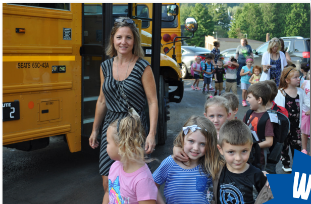
Off the Bus! Yea!