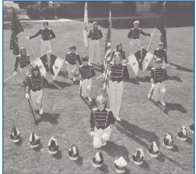
Color Guard 1969

No time for dinner on Open House night? No problem!