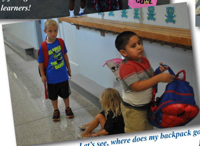
Let's see, where does my backpack go?