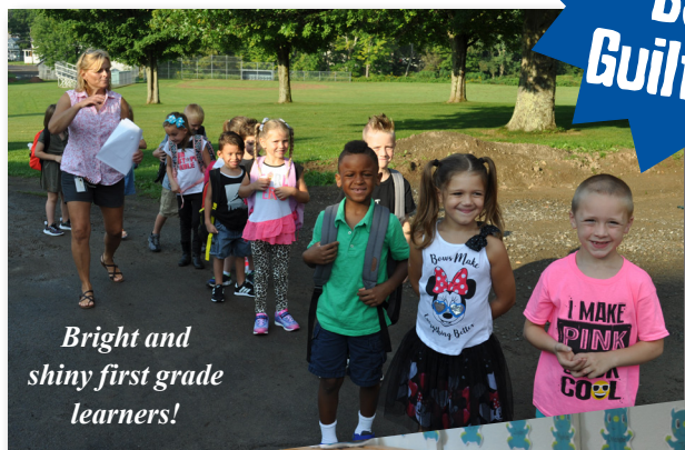
Bright and shiny first grade learners!